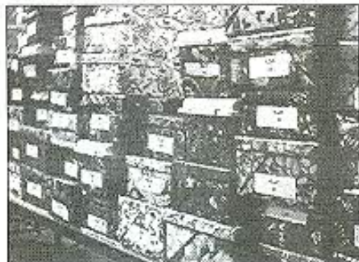
Just some of the boxes waiting to be presented to youngsters at the Union Mission Christmas party.

As parents brought their children forward by age groups, Santa took time to greet and speak with each one and then presented them with gifts. The Fairmont Lions Club has made this an annual project for many years and provides funding for this event in its budget each year.