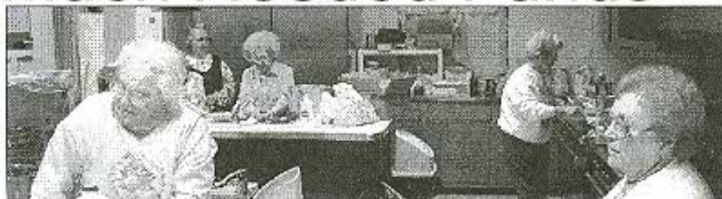
The kitchen crew cleans up following the soup bean and corn bread dinner.