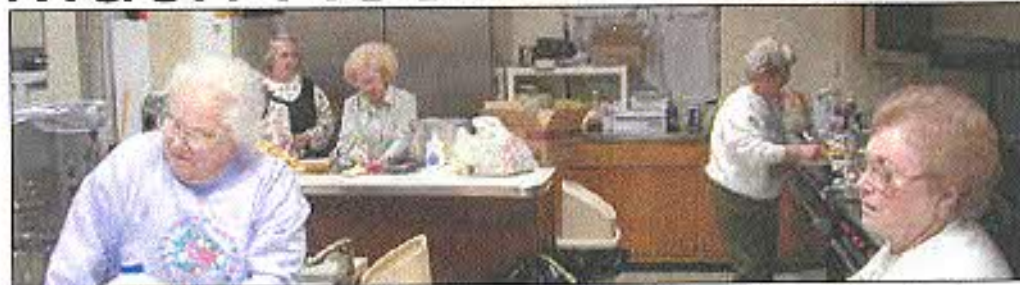
The kitchen crew cleans up following the soup bean and corn bread dinner.