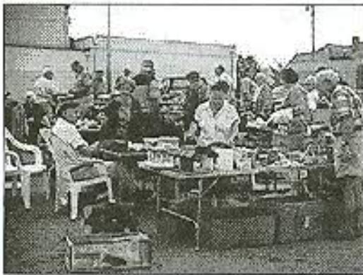
A large crowd sorts through merchandise at last year's Lions Club Yard Sale.