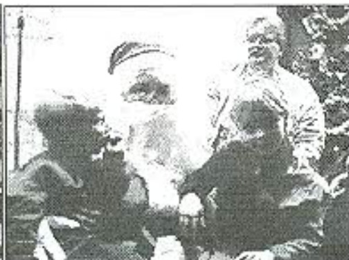
A couple of happy children enjoy a visit with Santa at the Union Mission Christmas party Dec. 17th.

Due to technical restructuring of their web spaces, Microsoft homepages has moved the Fairmont Lions Club's web site to this new address: