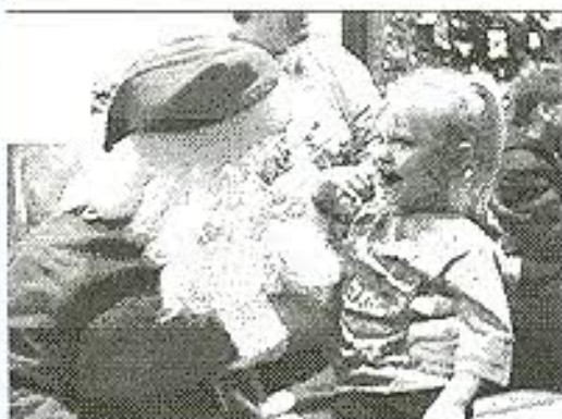
Smiles filled the Union Mission during the Christmas party sponsored annually by the Fairmont Lions Club.

Lions Clubs International is a member of the steering committee for the U.S.-based educational initiative to "Control Your Diabetes for Life." Lions are encouraged to contact their state health departments to find out what is being done in their area. Information is available on-line at: