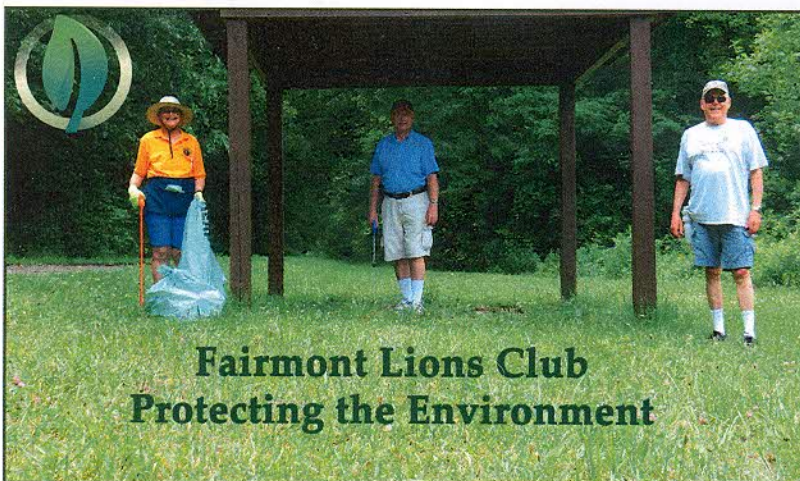
Fairmont Lions Club Protecting the Environment