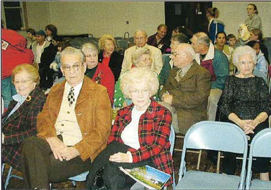
Club members look on as the children receive their gifts at annual party.