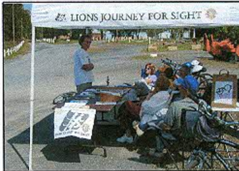
Lions register participants in the Lions Journey for Sight (left) and provide water at the Norwood end of the trip (right).