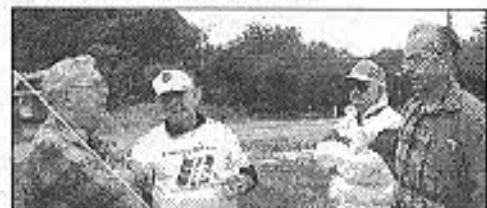
Lions Converse at Journey for Sight.