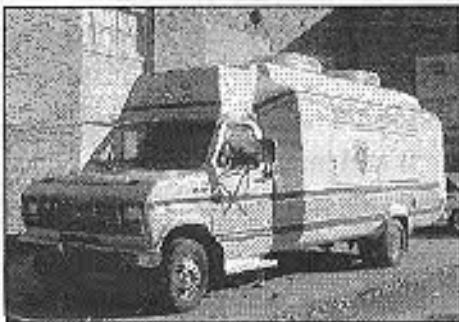
The Mobile Eye Screening Unit was on duty at FSHS Oct. 10.