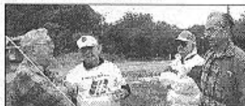
Lions Converse at Journey for Sight.