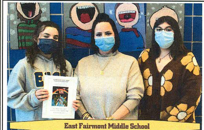
East Fairmont Middle School