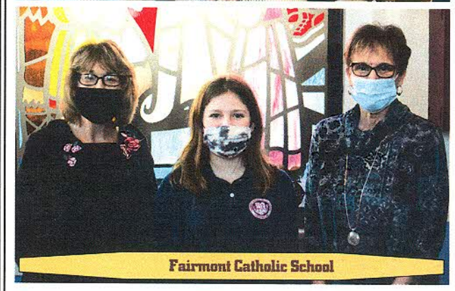
Fairmont Catholic School