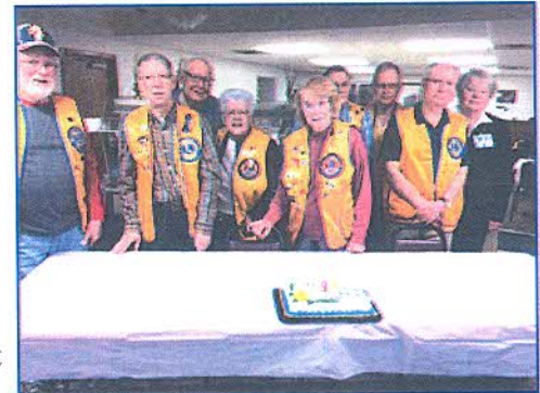
Club members enjoyed the 95 th birthday cake.