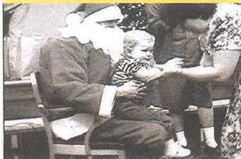
Santa Claus was the special guest at the 1997 Christmas Party for children at the Union Mission.