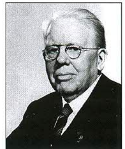
Melvin Jones Founder 1879 - 1961

He soon joined the Business Circle, a businessmen's luncheon group, which was one of many at that time devoted solely to promoting the financial interests of their membership. Melvin Jones, however, had other plans. "What if these men...were to put their talents to work improving their communities?" Thus, at his invitation, delegates from men's clubs met in Chicago to lay the groundwork for such an organization and on June 7, 1917, Lions Clubs International was born.