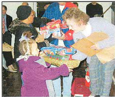
Children received gifts from the Fairmont Lions Club and other organizations December 16th.