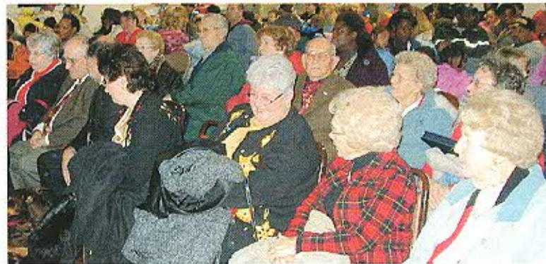
Lions and guests watch as gifts were presented to the children at the 65th consecutive Lions Christmas Party for the children at the Union Mission.