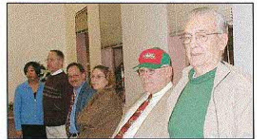
Lions watch as gifts are distributed.