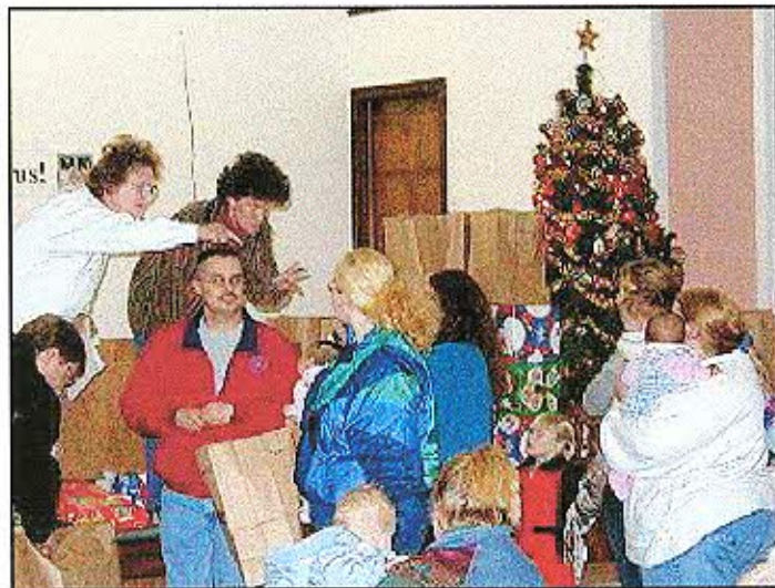
Children receive gifts at the Lions Club's annual Christmas party at the Fairmont Union Mission.