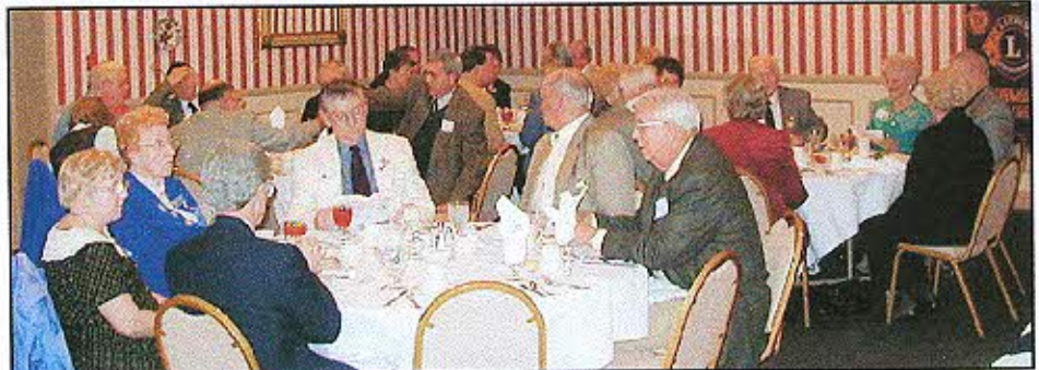
Members and guests prepare to enjoy the dinner at the 80th anniversary celebration at Westchester Village.

It was also announced that the Core-4 program was completed.