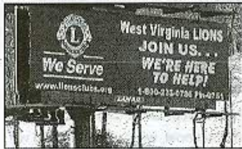
This billboard promoting West Virginia Lions Clubs is located near Lost Creek along I-79.