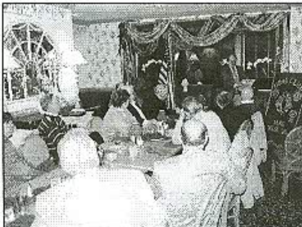
Lions met January 18th in the newly decorated dining room at The Poky Dot.